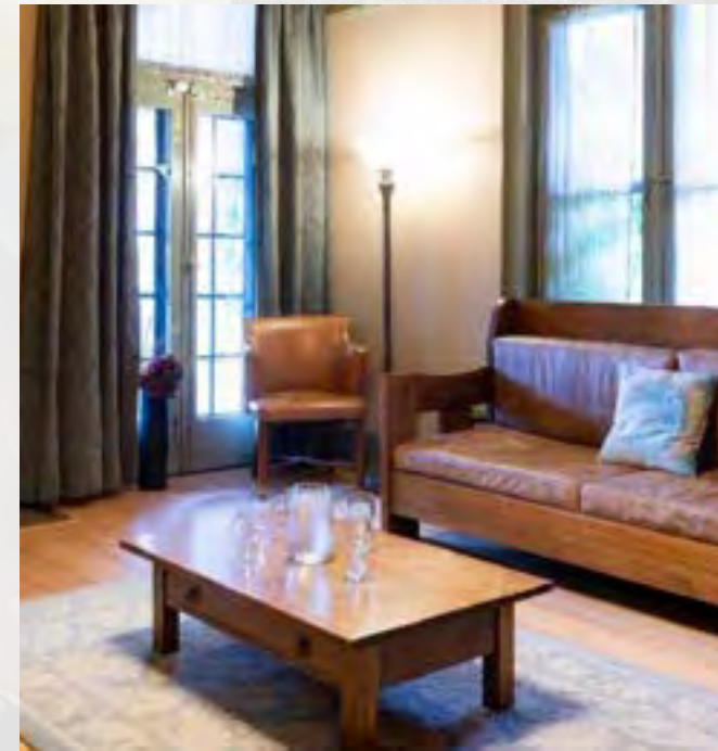
THE HIGHLAND ROOM