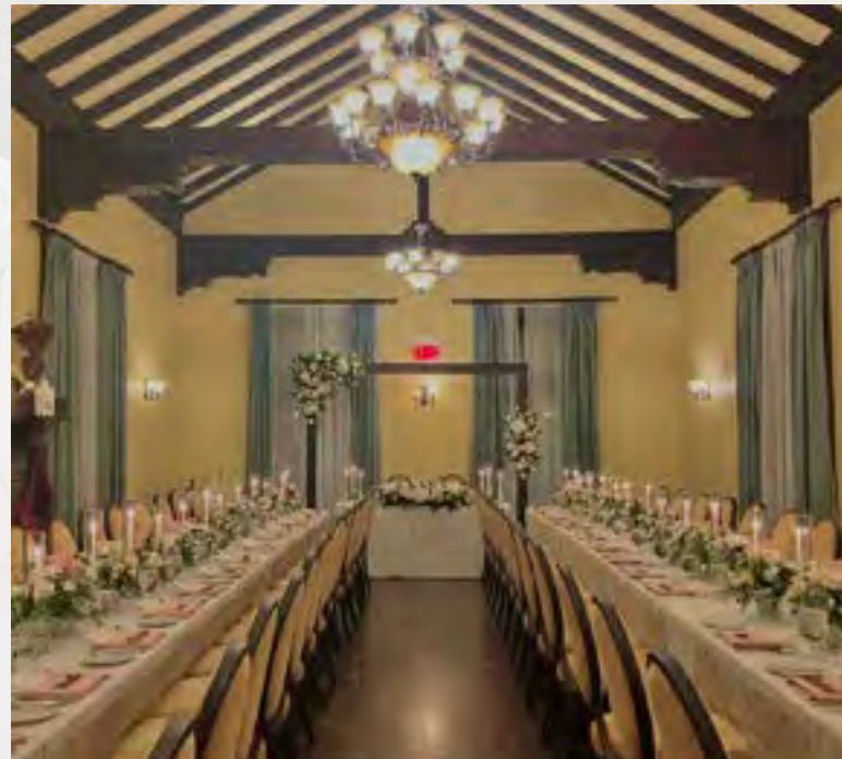
THE GREAT ROOM